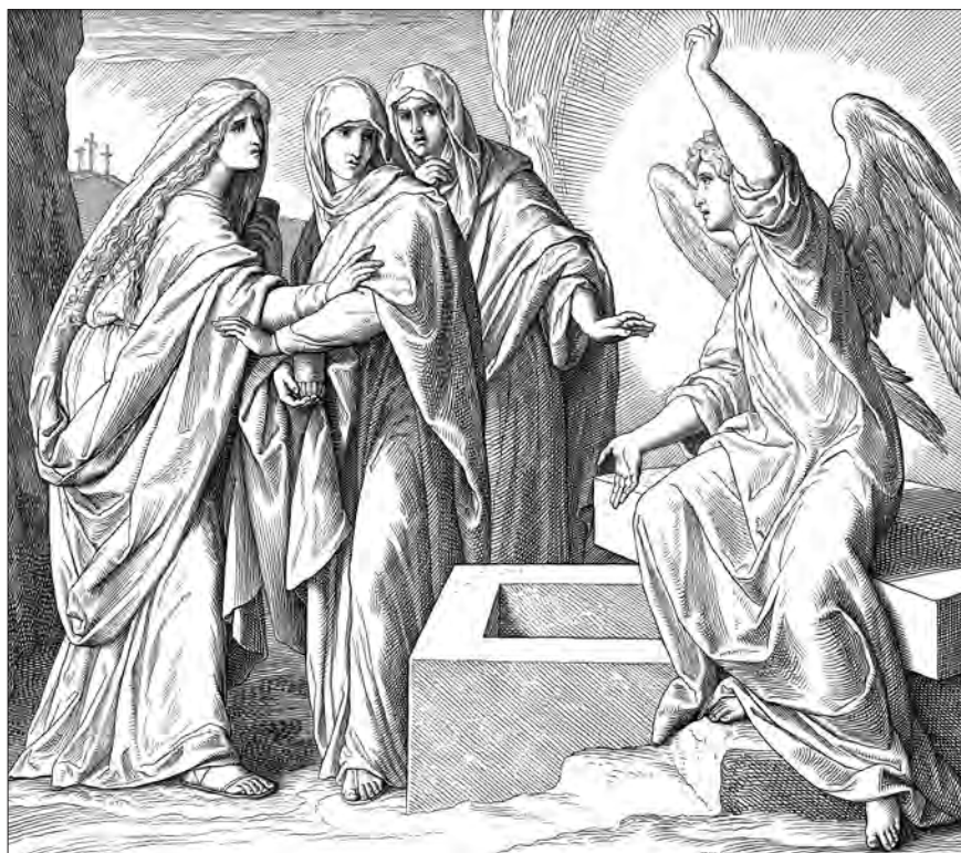
The Three Marys at the Empty Tomb Mary Magdalene, Mary Jacobe and Mary Salome

Martha was the first to say, “Lord, I have believed that thou art Christ the Son of the living God, who art come into this world” (John 11:27). Martha was witness to Jesus resurrection of her brother Lazarus (John 11:39-44). Martha’s relics are in Collégiale Sainte-Marthe in Tarascon.