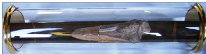
A piece of the tibia of St. Mary Magdalene